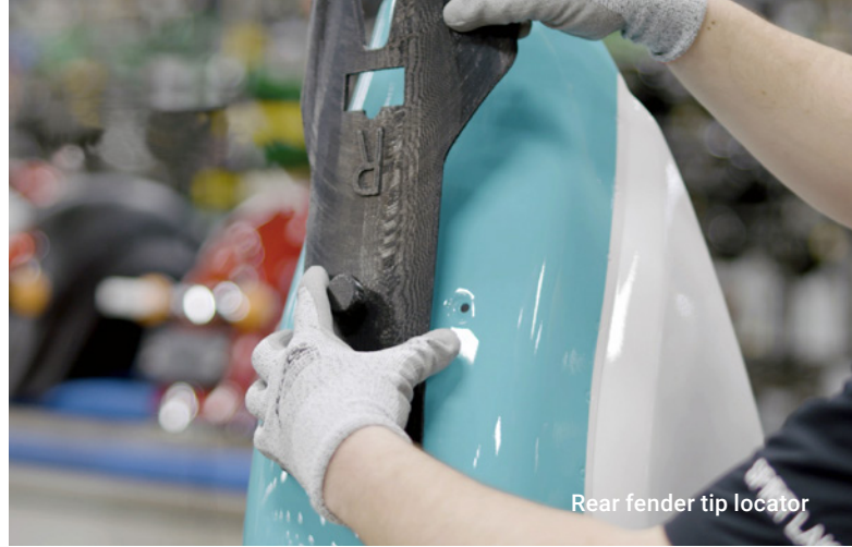
Rear fender tip locator

The use of elastomer material has enabled the team at Polaris to rapidly iterate and test multiple, geometrically accurate designs for the intake duct on one of their vehicles. "It allows us to 3D print parts and upfit on our vehicles quickly, to help catch mistakes or identify areas for improvement, giving us better understanding of which designs we want to pursue," explained Will Fickenscher.