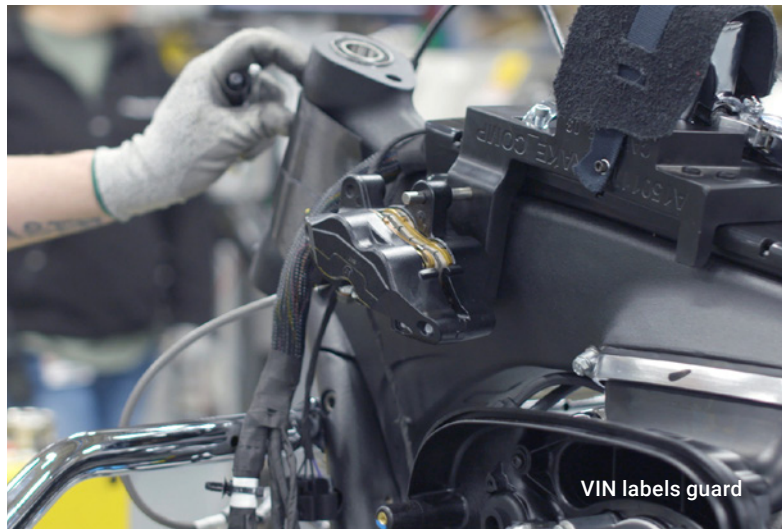
VIN labels guard